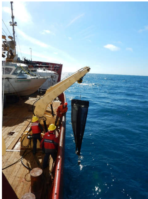
Figure 4. Vertical Bongo nets deployed over the side for collection of zooplankton.