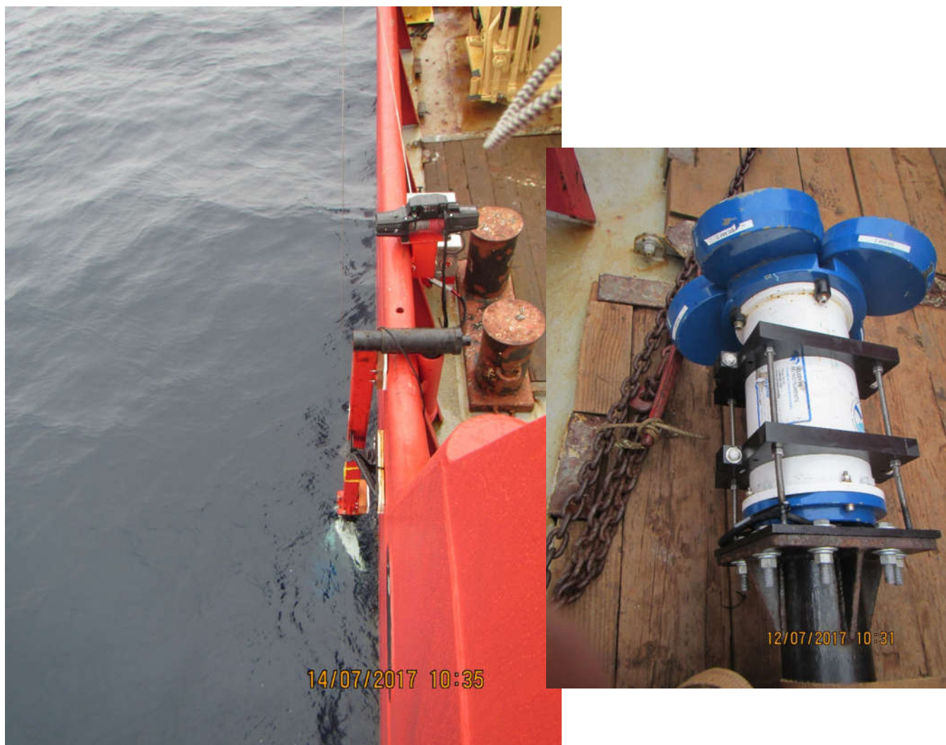
Figure 5. 150 kHz Acoustic Doppler Current Profiler (ADCP) deployed over the side at most CTD/Rosette stations for measurements of currents every 4 m from 5 m below the ship to the bottom.