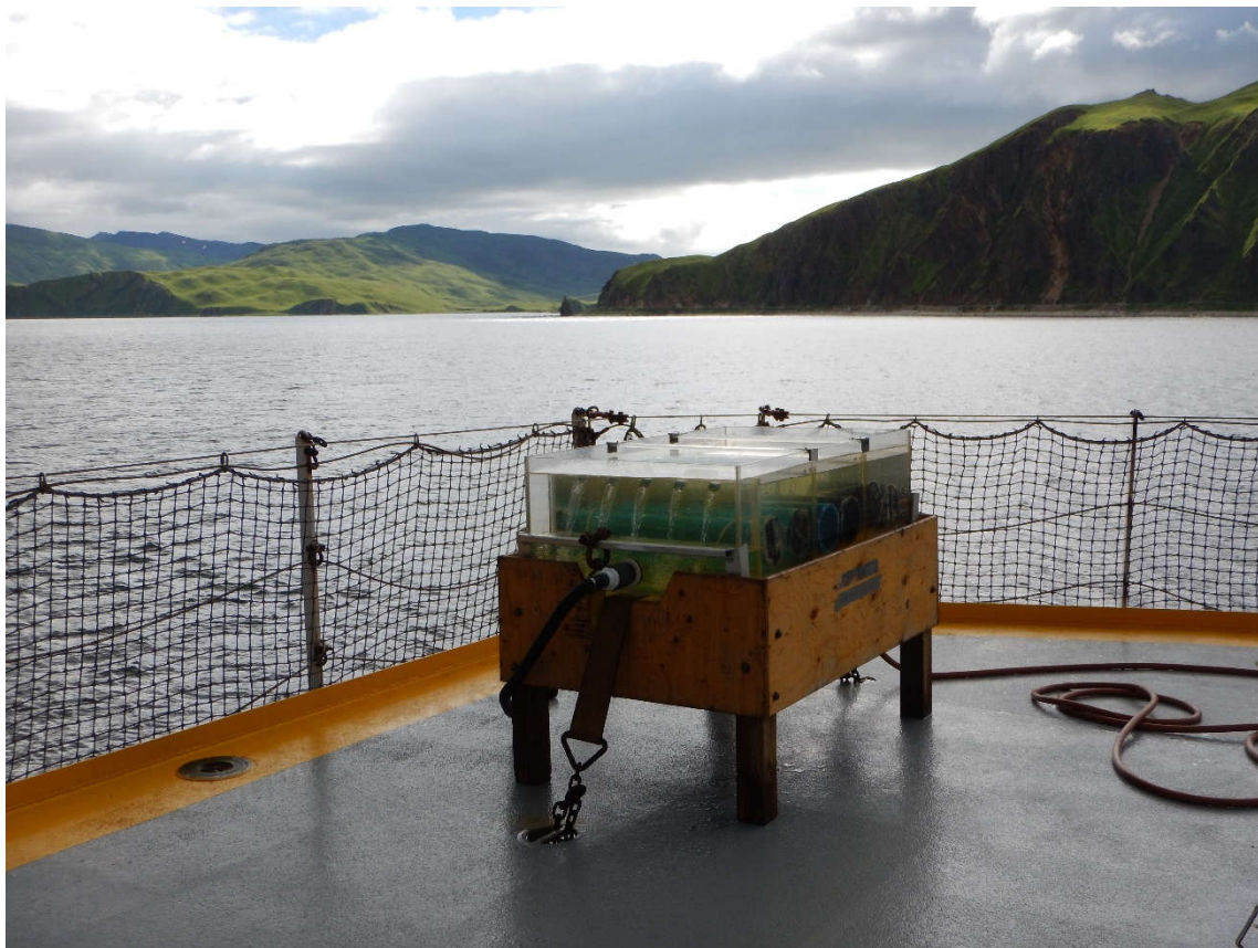
Figure 6. Phyto-plankton incubators on the helicopter deck.