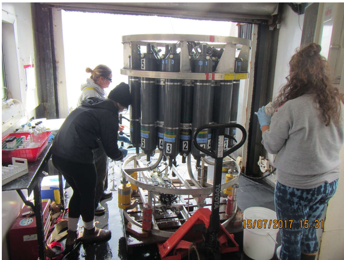
Figure 3. CTD/Rosette system with 24, 10 liter Niskin bottles deployed over the side of the ship 62 times during the trip.