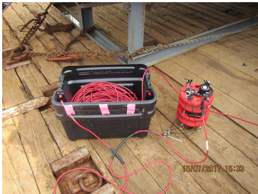
Figure 7. Apparent optical property package (C-OPS) that was lowered over the side of the ship.